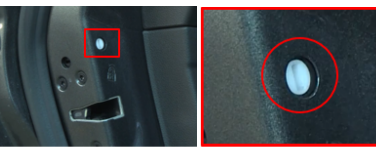
Above: Driver side door is pictured; passenger side door is similar

If you cannot see a slotted white circle in this opening, be sure to note this in the website when you submit the results of your inspection.