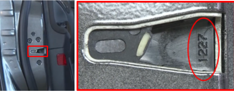
Above: Driver side door is pictured; passenger side door is similar